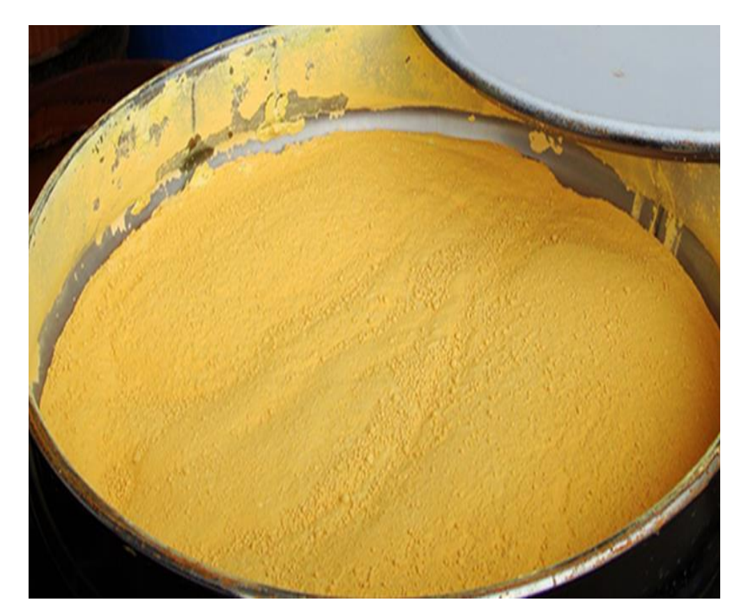
Uranium oxide "yellowcake" is processed from uranium ore before enrichment.