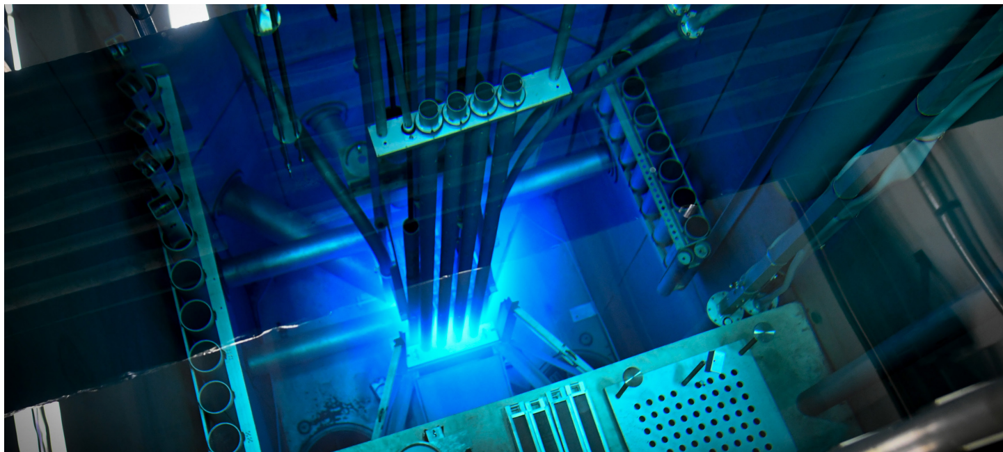
The conduct of irradiation tests in North Carolina State University's PULSTAR reactor pool in support of the Nuclear Reactor Program.