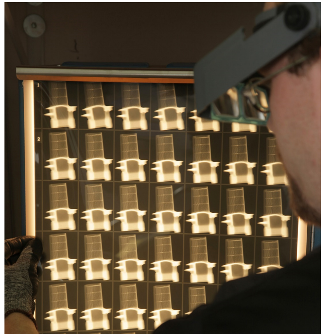
A neutron image of jet turbine airfoils acquired using the PULSTAR reactor’s Neutron Imaging Facility.