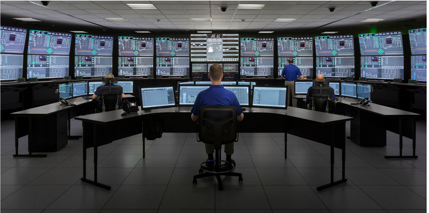
The world's first small module reactor control room simulator in Corvallis, OR.