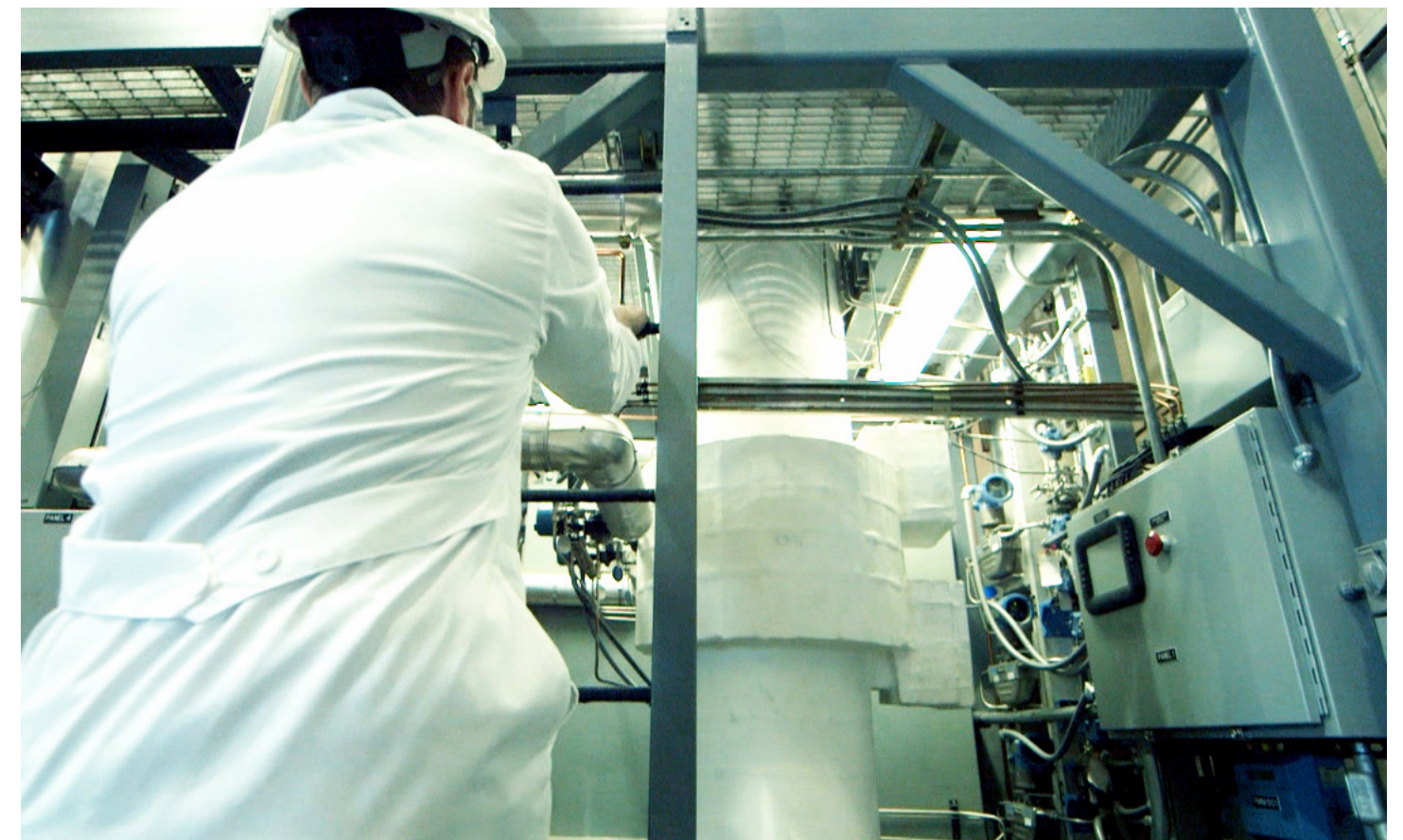
In designing the NuScale Power Module™ and power plant, NuScale has achieved a paradigm shift in the level of safety of a nuclear power plant facility.

Wu added, "Many of our students are now at the national labs, at Westinghouse, Areva, TerraPower – and NuScale, of course." Further, he says the 300 NuScale employees at its office in Corvallis, a community of 58,000 residents, have a major positive impact on the economy. He said OSU estimates NuScale's presence adds approximately $150 million to the economy annually.