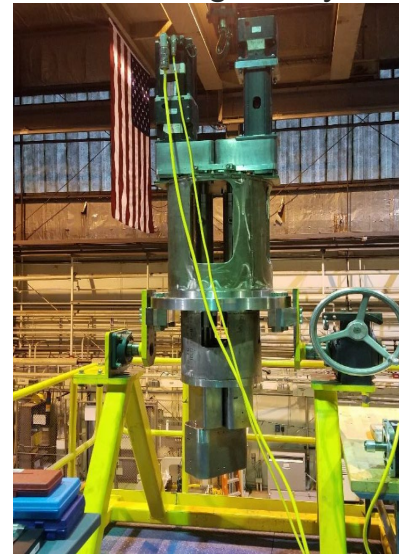
METL Test Article – Gear Test Assembly (example)