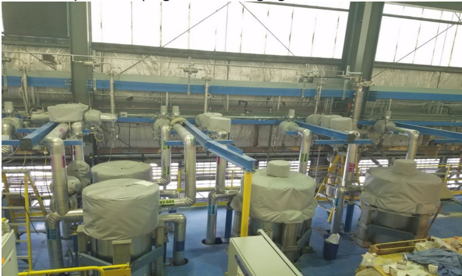
METL Facility - ANL